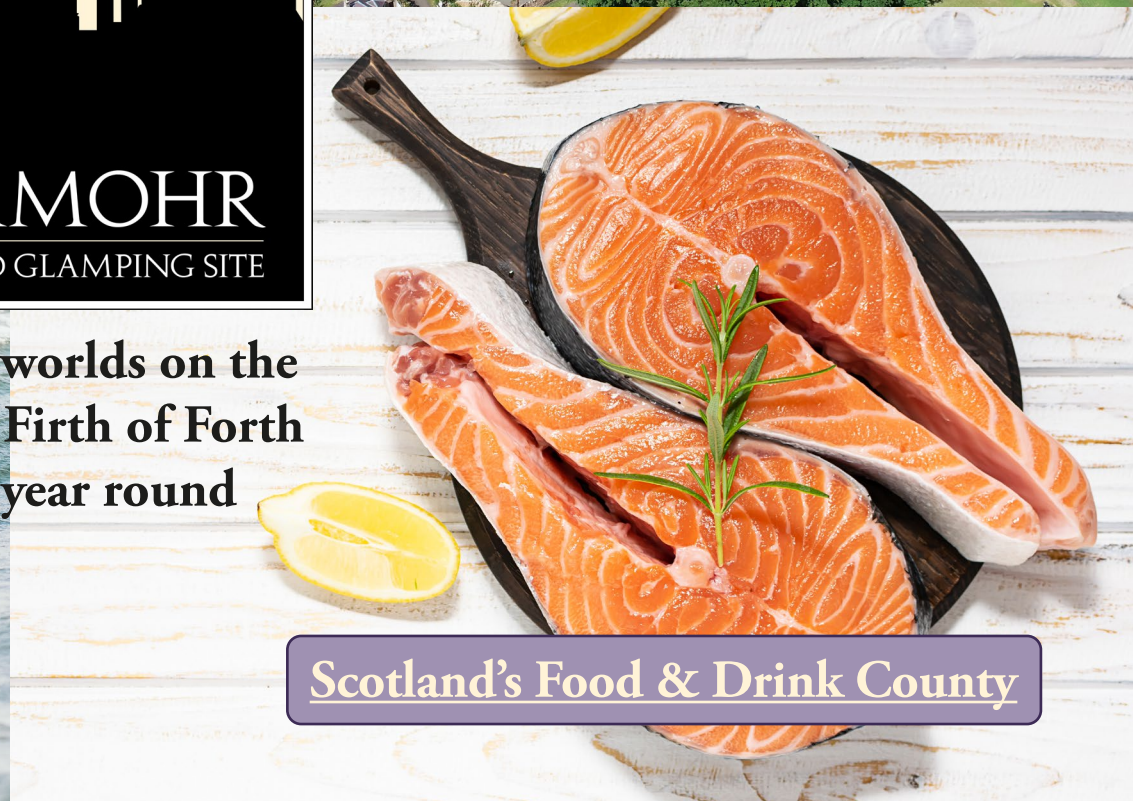
Scotland's Food & Drink County

Best of both worlds on the shores of the Firth of Forth - open all year round