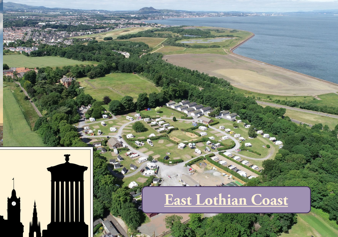
East Lothian Coast